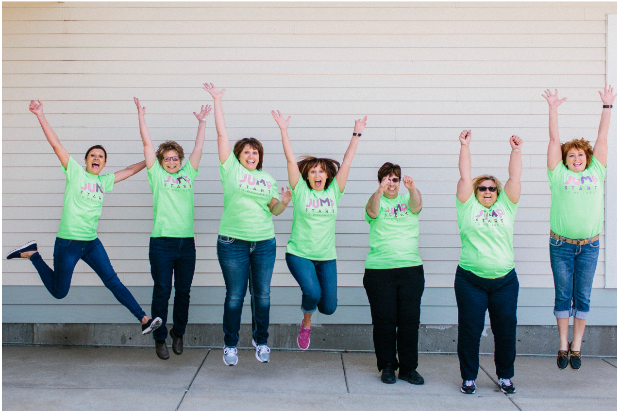
Coal Country Community Health Center Staff, Beulah, ND